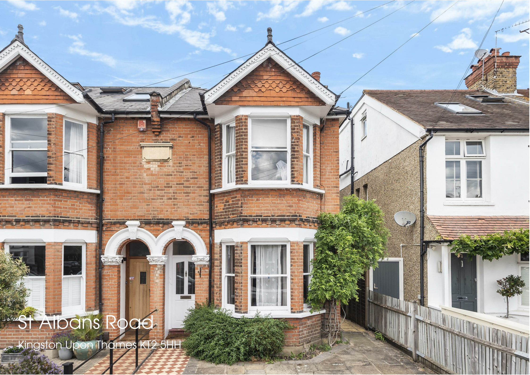
St Albans Road Kingston Upon Thames KT2 5HH

34 Richmond Road Kingston upon Thames Surrey KT2 5ED www.gibsonlane.co.uk Tel: 020 8546 5444